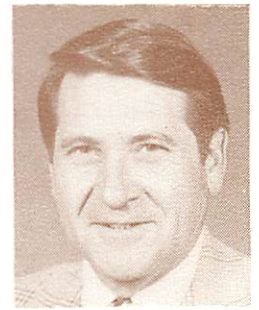
Joseph E. Frazier