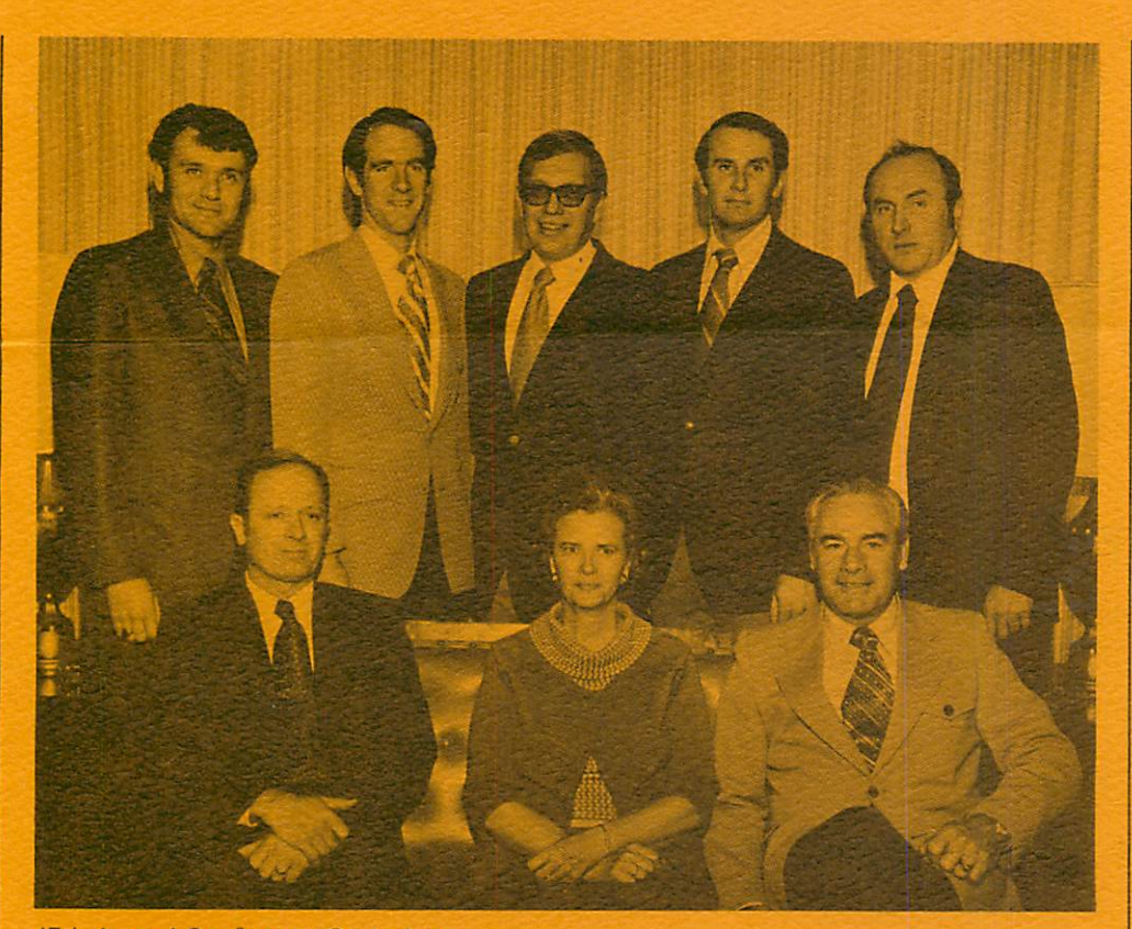
47th Annual Conference Committee: